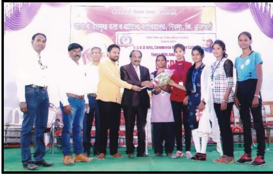
Prize Distribution Ceremony