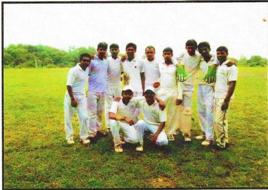
1) Cricket Team And 2) Baseball Team