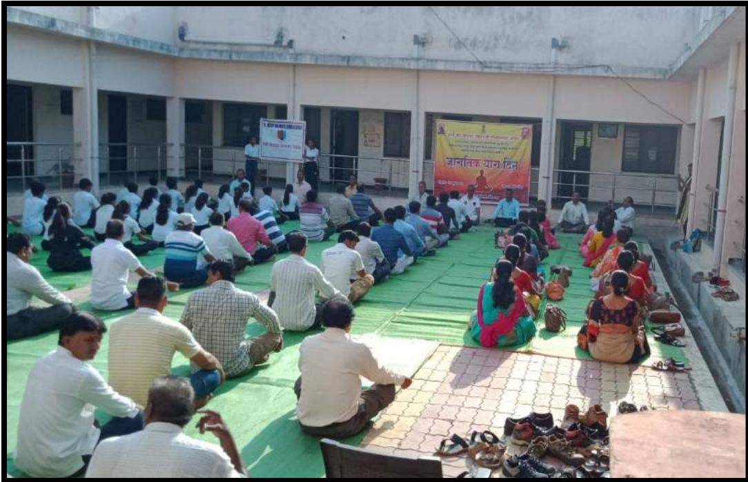
Teachers Participation in Words Yoga Day 21 st June