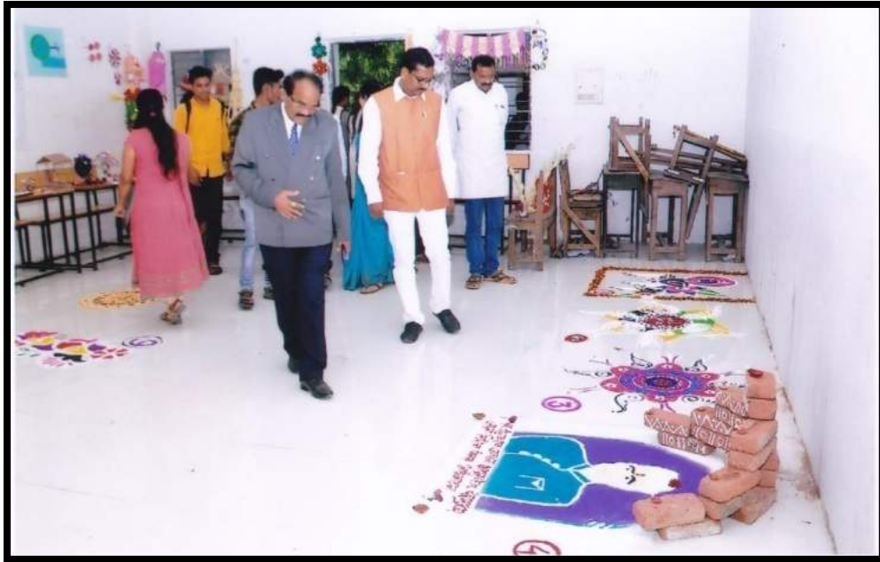
Rangoli and Dish Decoration