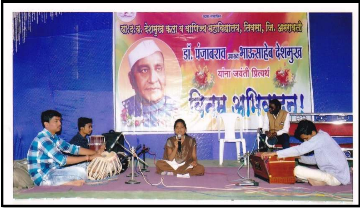
Students Participations in Singing Competition