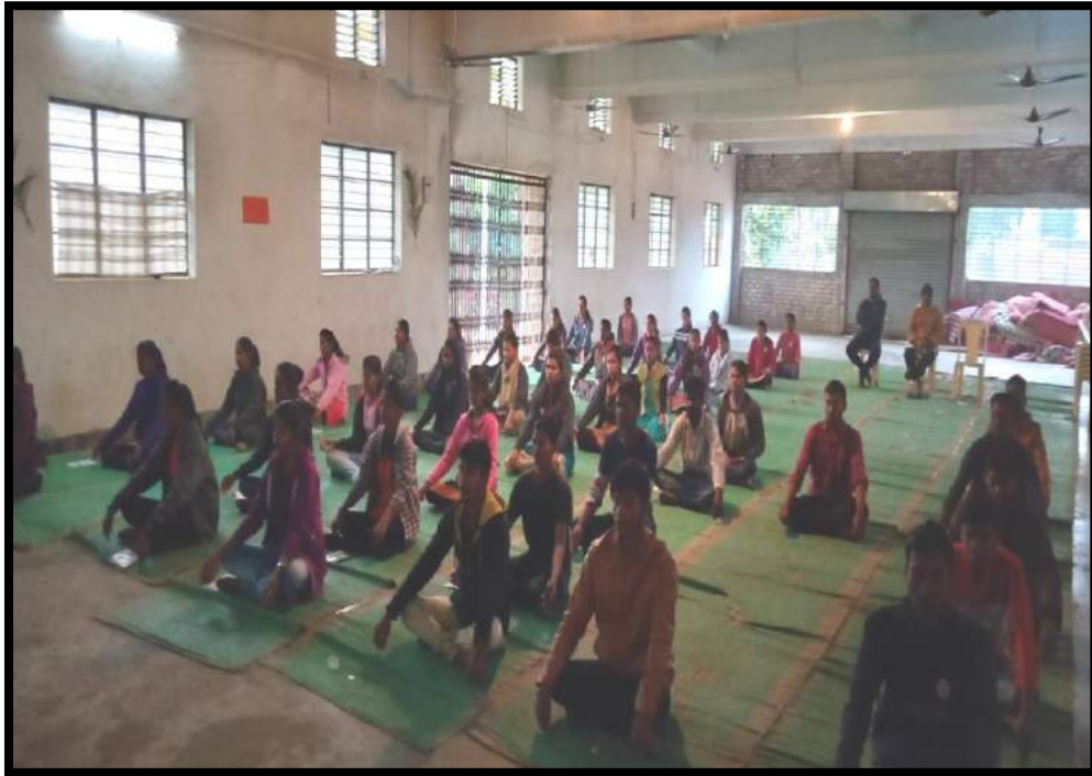
Students Participation in Yoga Day